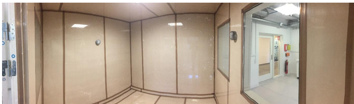
Figure 1: Panoramic view of the climate chamber